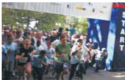
Nearly 5,000 people attended Race for the Kids this year