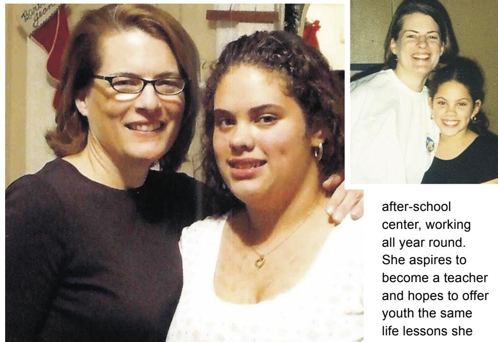
after-school center, working all year round. She aspires to become a teacher and hopes to offer youth the same life lessons she has been given.